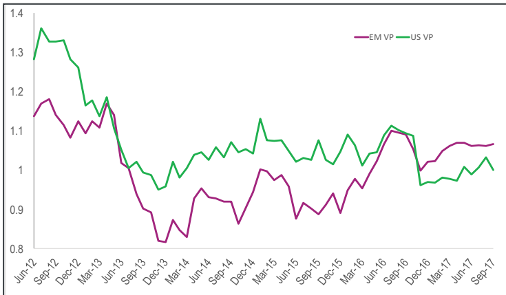
Data quoted represents past performance, which is no guarantee of future results.